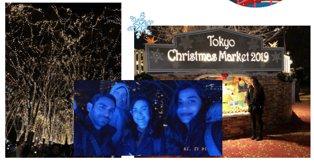
I saw illuminations in Sendai and Tokyo.

I went to a beautiful Christmas market. They had lots of food and drinks.